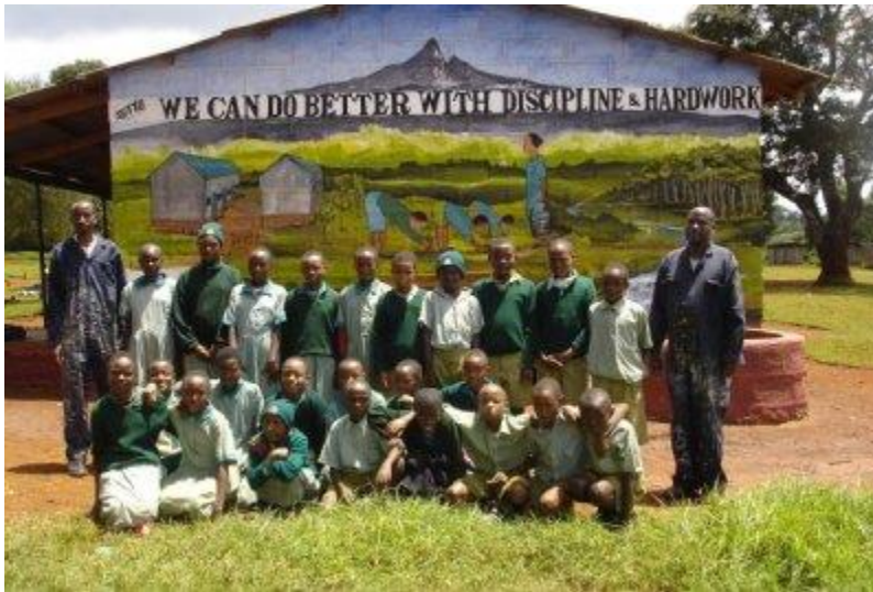
International mural, Kenya

With the support of Painting a New World (PNMW), KSEI began the participatory process of producing a mural in partnership with local farming communities.