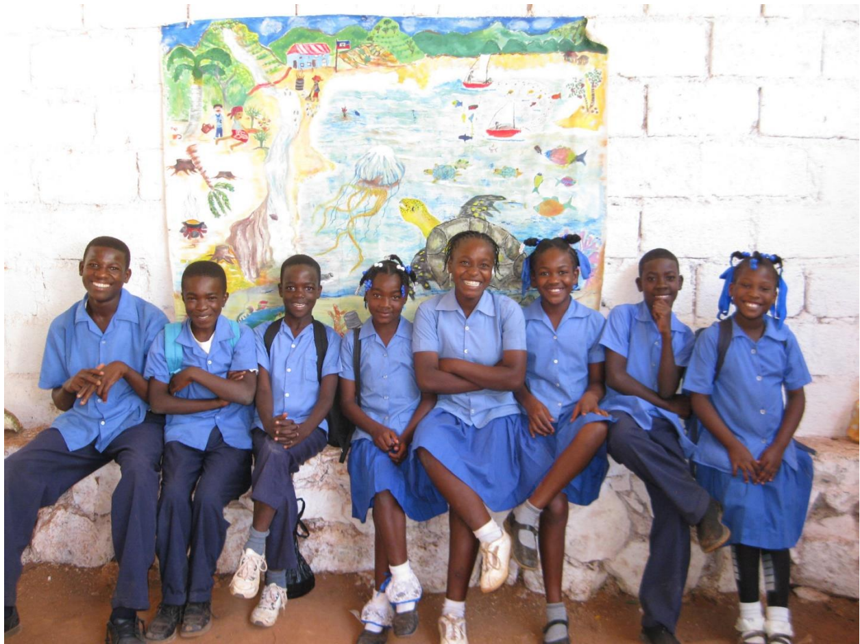
International mural, Haiti