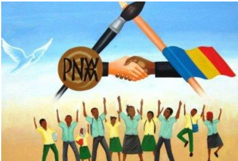
International mural, Chad

We believe that art has the power to create positive and lasting change for local communities and those in developing countries.