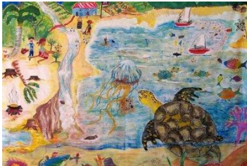
Protect the environment, Haiti

The entire community is grateful for the mural. We look forward to producing more murals in other centers to continue to highlight the issues facing the environment and the community.